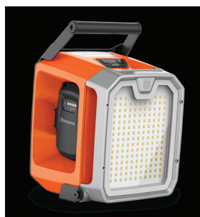
HUSQVARNA WL 81 970 61 73-01