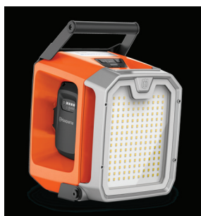
HUSQVARNA WL 81 970 58 49-01