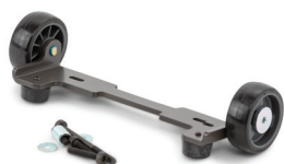
WHEEL KIT 589 33 43-01